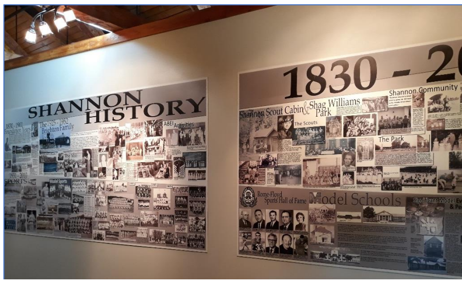
EXISTING 4' x 8' WALL PANELS AT ENTRANCE TO SCOUT CABIN

This 76' flagpole was erected at Brighton Mills in the 1920's. It is considered to mark "dead center" of Shannon Georgia. But what makes this flagpole historical is that in 1946 the Nation's first monument in memory of WWII American deaths was erected beneath this flagpole. The pole was taken down and reworked in 2018, and should now be good for another hundred years.